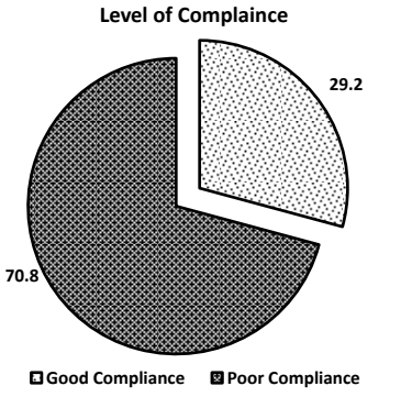
Figure 3. HIV treatment compliance (n=171)

Figure 3 illustrates the treatment compliance of the respondents, indicating that 70.8% had good compliance while 29.2% had poor compliance. The reasons for noncompliance are presented in Table 3. The analysis reveals the most prominent reasons for noncompliance, which include feeling good and healthy ( 2.63\pm1.06 ), tired of taking pills ( 2.50\pm0.93 ), wanting to make a difference in daily life ( 2.44\pm0.96 ), spoilage of pills ( 2.37\pm0.98 ), and feeling depressed ( 2.36\pm0.99 ). On the other hand, forgetfulness was the least reported reason for noncompliance ( 1.98\pm1.04 ).